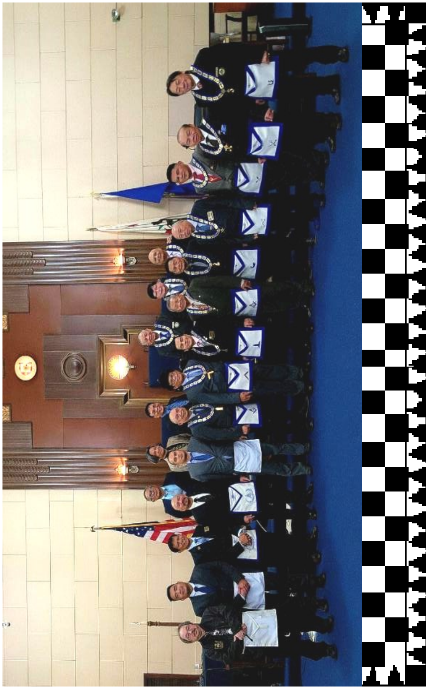
April 6, 2023 Monthly Stated Meeting