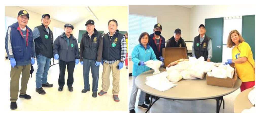
Food distribution at Teglia Community Center